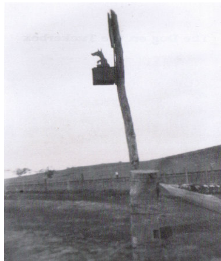
The earlier monument in 1926